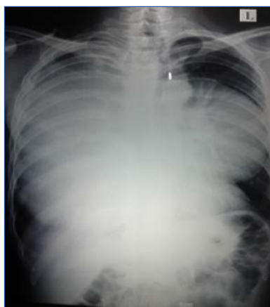
Figure 1. X-ray: Right sided homogenous opacity of lung field

A right-sided video-assisted thoracoscopic surgery (VATS) was performed which revealed a large cystic lesion occupying 3/4 th of right chest compressing the right lung with a part of the cyst extending between the aorta and superior vena cava and going into the left chest, Figure 3. To ensure complete excision the incision was converted to a formal right lateral thoracotomy. The cyst contained two