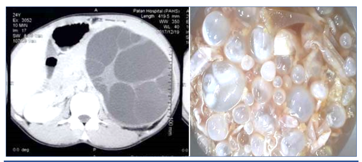
Figure 1a. CT and splenectomy specimen of a 24 year female HD patient operated at Patan Hospital, PAHS